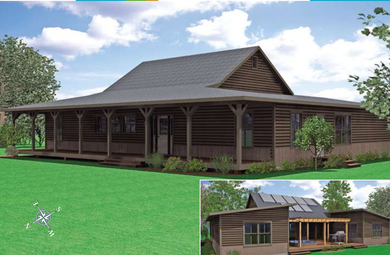
Shown with optional porch, deck and trellis. Solar panel look may vary from those shown.