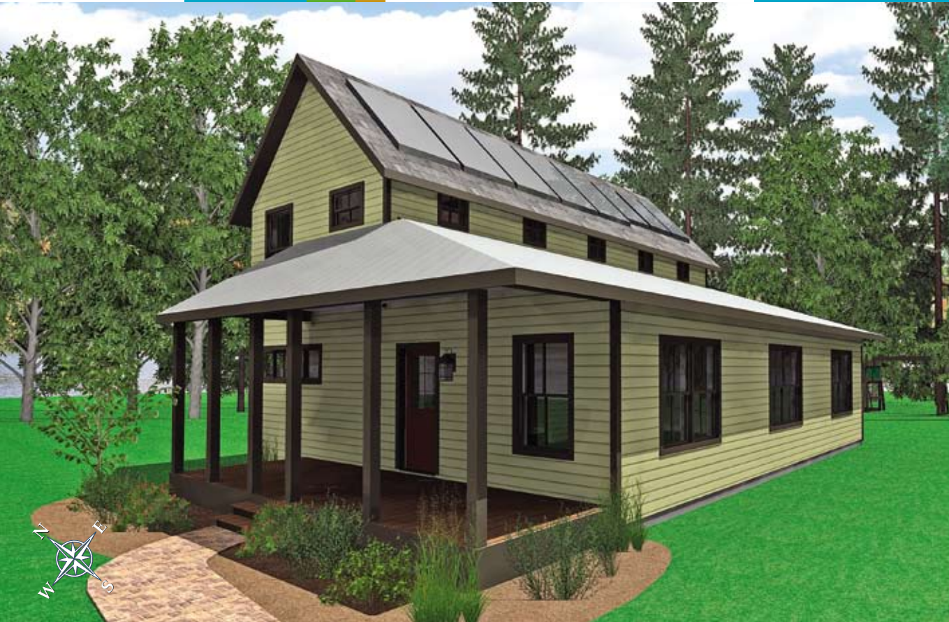
Shown with optional porch. Solar panel look may vary from those shown.